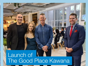
Launch of The Good Place Kawana