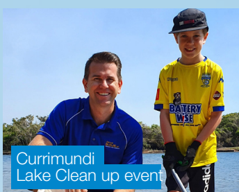
Currimundi Lake Clean up event

(Photos taken prior to social distancing)