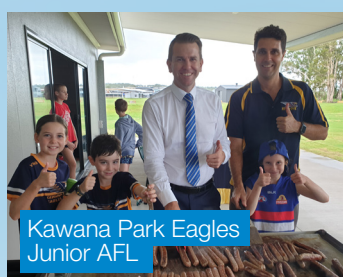
Kawana Park Eagles Junior AFL